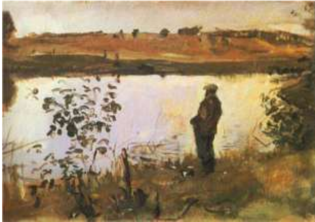
(Artist: Valentin Serov Date: 1905)

Let man run to his heart and stand in speechless joy Let man not concentrate on his flowerless labours. Let man witness the divine breeze gently blowing. Let man enjoy the strangely attractive divine fragrance. Let man run to his heart and stand in speechless joy. Let man behold the gorgeous flower of divinity. Let man not muddy the river of