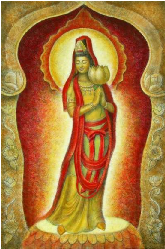
(Artist: Sue Halstenberg)

If you are still afflicted by the deep seated mortal diseases. If you have not said your deepest prayers. Then fruitless is thy passion! O mortal!